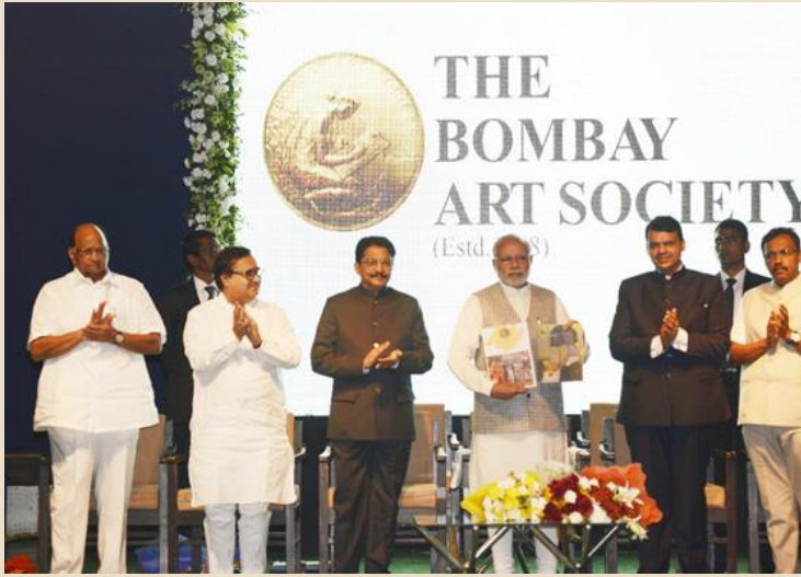
The Bombay Art Society Art Complex: Inauguration Feb 2016